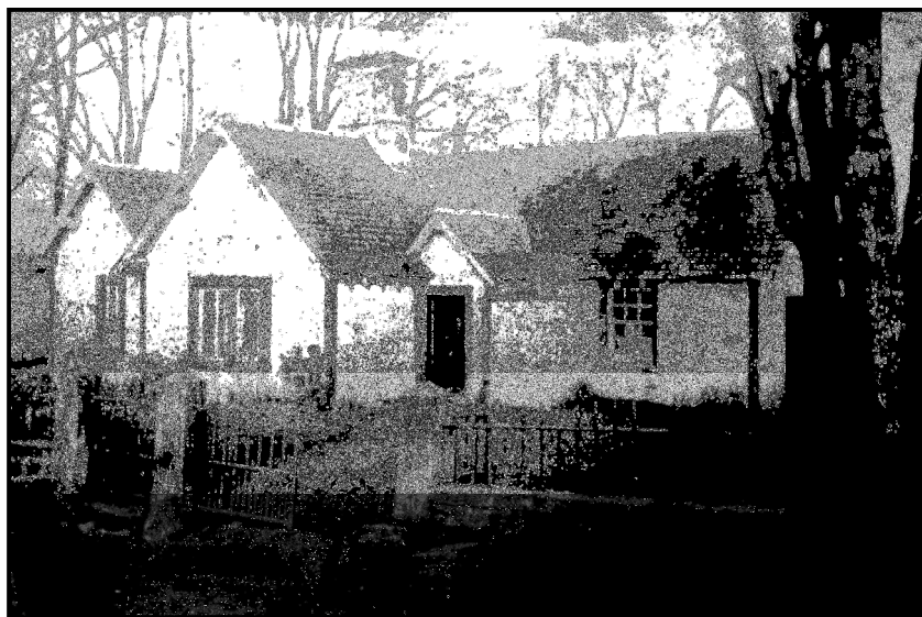
The Area's first school