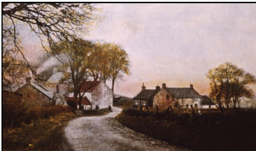
The Shank of Navity from the road towards the cemetery.

TOWARDS THE CHURCH FROM THE CEMETARY THE PRIORY IS TO THE RIGHT OF THE PICTURE