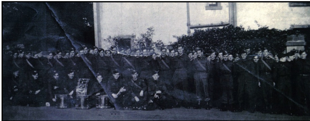
ON CHURCH PARADE AT BALLINGRY CHURCH 1939/45.