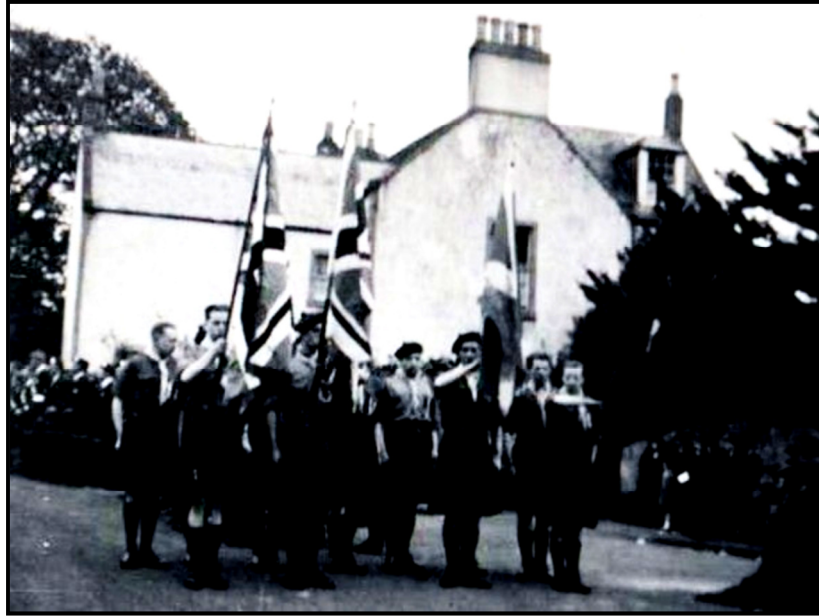
COLOUR PARTY AT BALLINGRY CHURCH